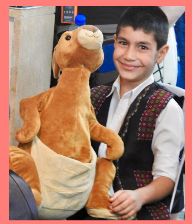
A warm welcome for the newest member of our HCP Family