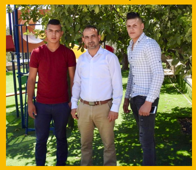
No, they aren't movie stars, but it feels like it when our graduates come to visit us!