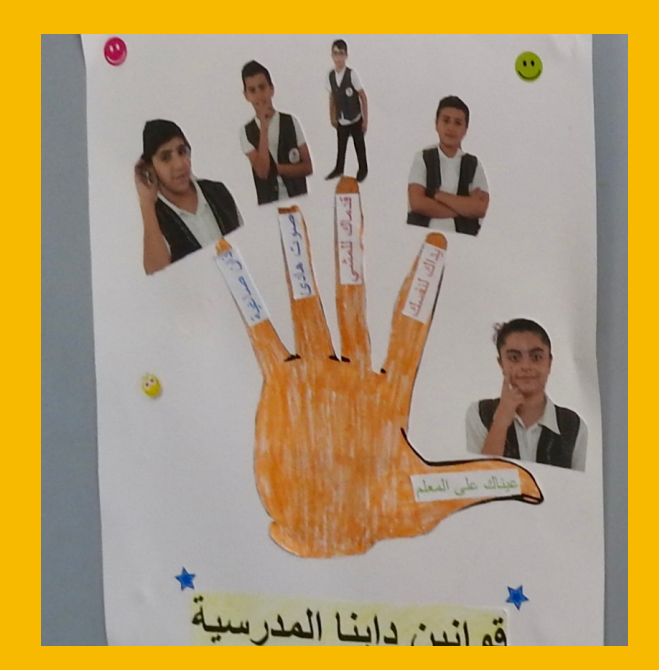
Give Me Five School Rules by Students