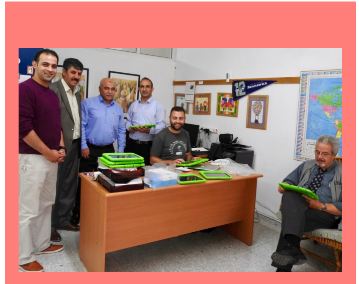
The gathering of "technicians"

• As a result of an extraordinarily generous gift of 35 iPads from Australian educators who visited HCP, we were able to start a "learning through technology" program for our students. With a visit from the Bethlehem Ministry of Education and Partners for Sustainable Development Co. we were able to configure the iPads so they could be used in the classrooms, accessing the electronic curriculum of the Palestinian Ministry of Education. This is an exciting development for our program as it increases the range of being able to individualize the curriculum for each student. It is particularly helpful with nonverbal and learning disabled students in providing them with alternative ways to engage and respond to the curriculum.