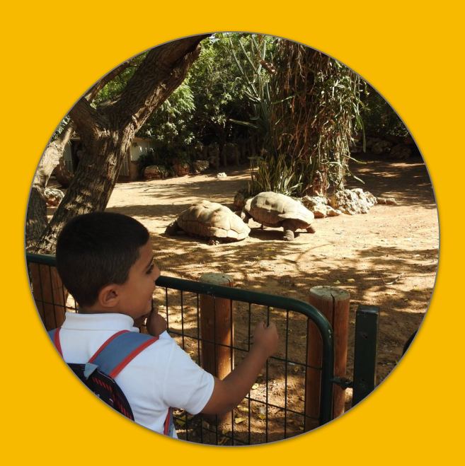
Contemplating the tortoises