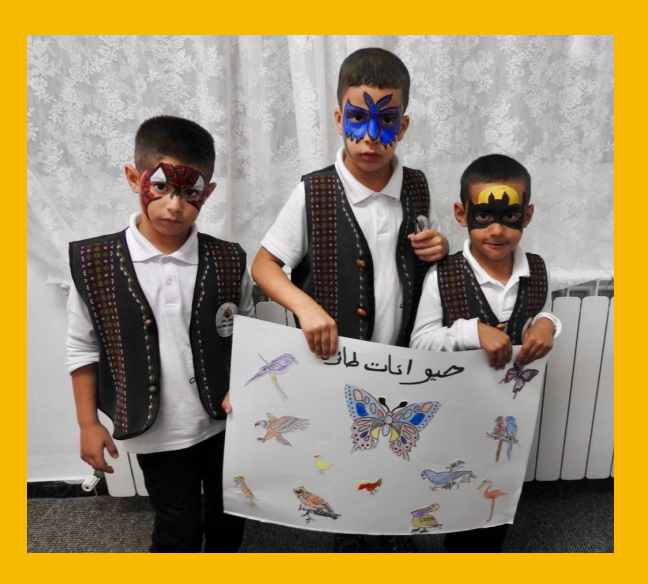
Winged creatures present on winged creatures!