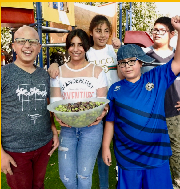
October's champion olive harvesters!

snacks for a mid-morning break. We knew that even after they went home some would have to wait for several hours before they had their main meal of the day, especially if their mothers were working. Lack of nutrition made it difficult for some of the students to focus and attend during class. Now, students receive 3 delicious hot meals per week such as chicken and rice with salad, and two days a week they receive nutritious sandwiches with lots of fresh vegetables like cumpers and tomatoes on the side. HCP feels even more like home with delicious smells wafting from the kitchen and the students and staff are loving it! Many of the families have thanked us via Facebook for feeding their children such delicious meals.