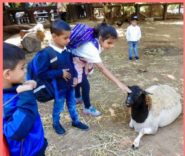
Chatting up the sheep at the zoo