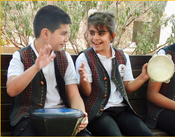
Budding musicians enjoying music lessons