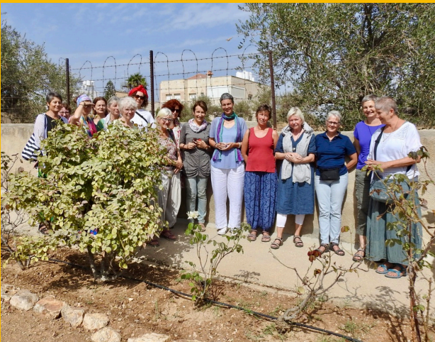
Our German guests visiting the memorial rose garden