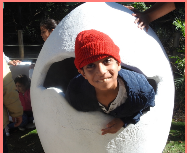
Newly hatched HCP student at Safari zoo!