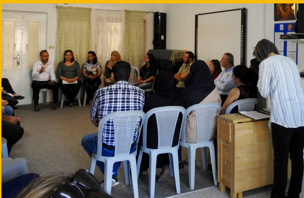
First parents's meeting of the school year

Each mother had to have their picture taken with their certificate and then a the course of the group. Interestingly, the mothers continued to show up for group a couple of times even though they had graduated! We are hoping sometime in 2019 to be able to start the advanced Incredible Years Parenting program. We have been besieged with requests by all four of the graduated mothers groups to offer the next level.