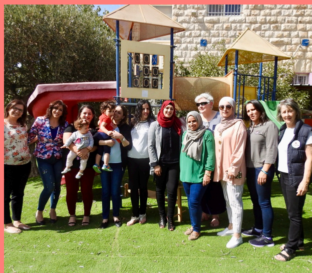
Graduating mothers along with the two incredible babies born during their group