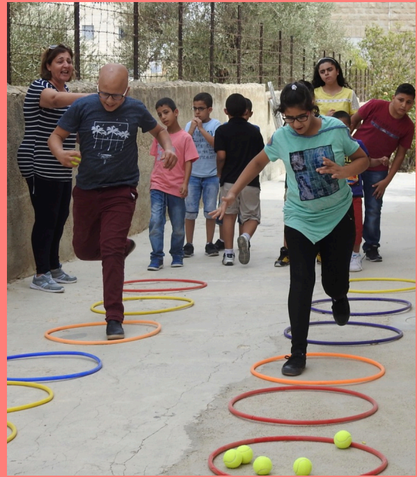
Post olive picking games