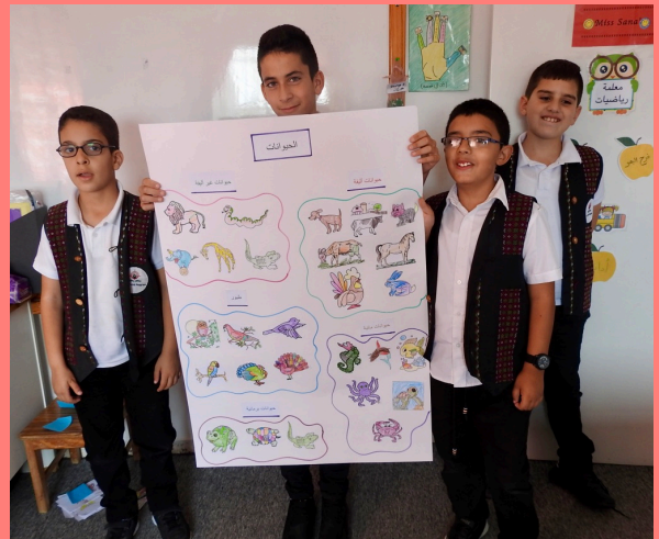
We're ready to go to the zoo, are you?