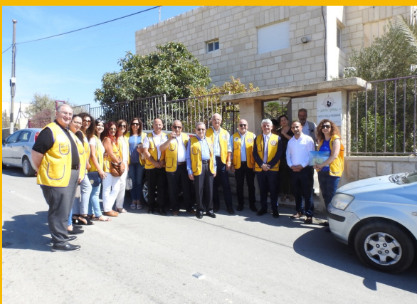
A special visit from the Bethlehem Lion's club!

It also helps to know that we will follow and work with them for two years to ensure a successful transition.