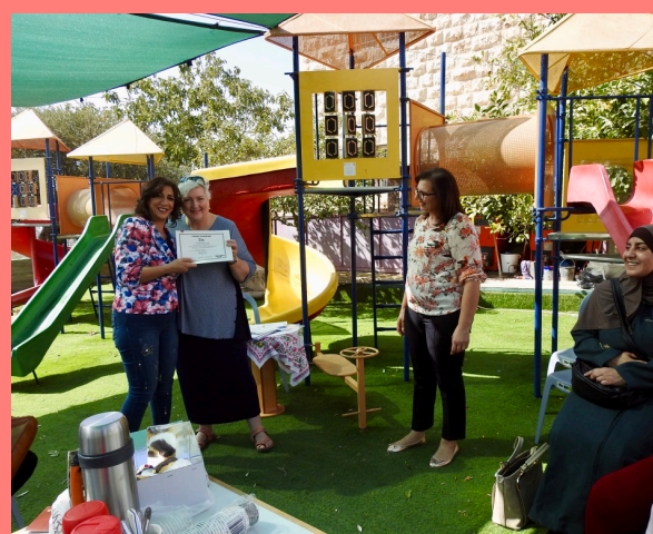
One of the mothers receiving her Incredible Years certificate!