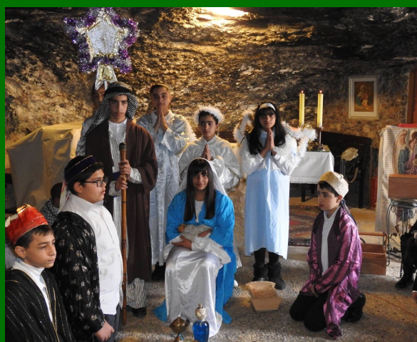
Nativity Play in the Grotto of Shepherd's Field