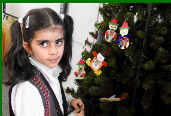
Trimming the Christmas Tree