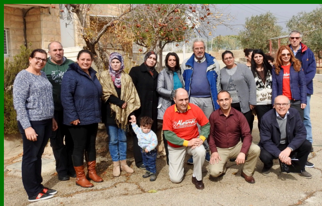
Aleimar visitors with grateful parents!