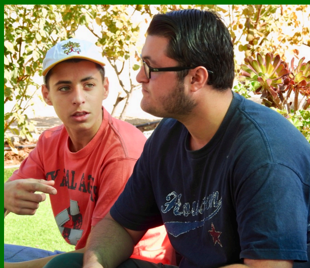
Two of our former graduates visiting HCP