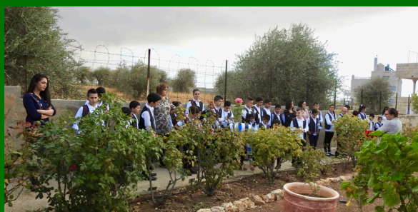
All Souls Day- Prayers in the memorial rose garden