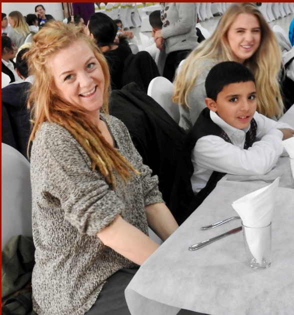
Two of the Norwegian students enjoying the Christmas Lunch!

While not optimal, it is understandable that the graduates may be struggling to adjust from a classroom size of 5 to one with 32-35 students. Unfortunately, we are not able to offer any assistance to their families of origin because we have no information regarding who and where they are.