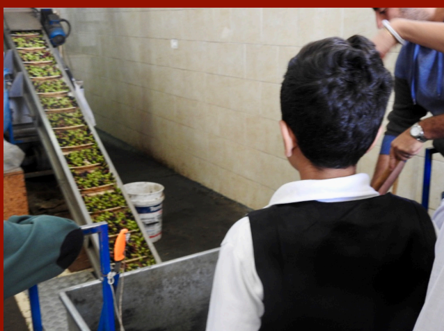
Watching the olives go into the press