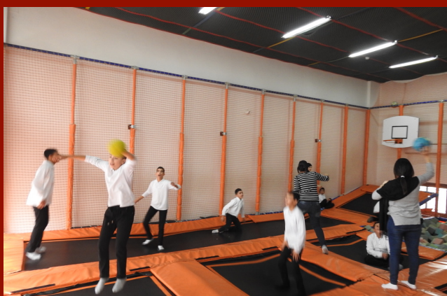
Jumping for joy at Bumble Bee fun center!