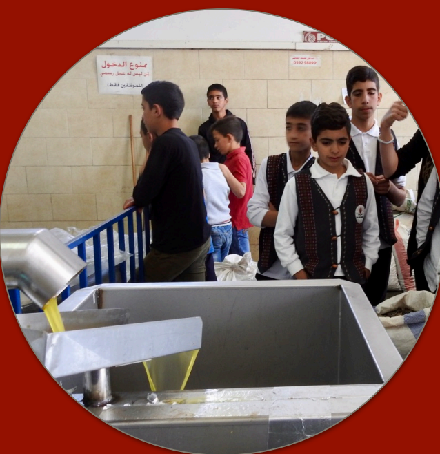
Liquid gold, otherwise known as olive oil