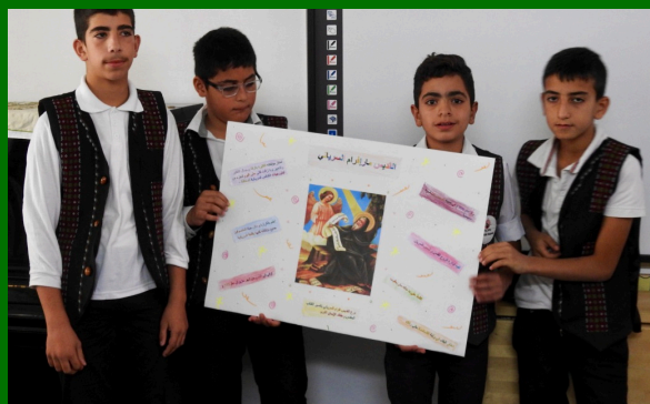
All Saints Day Presentations