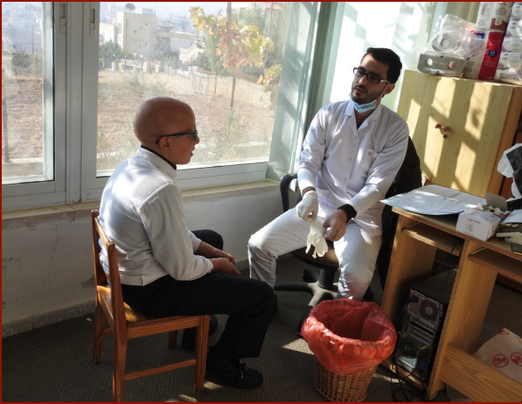
Dental screenings by "Beit Al Nour"