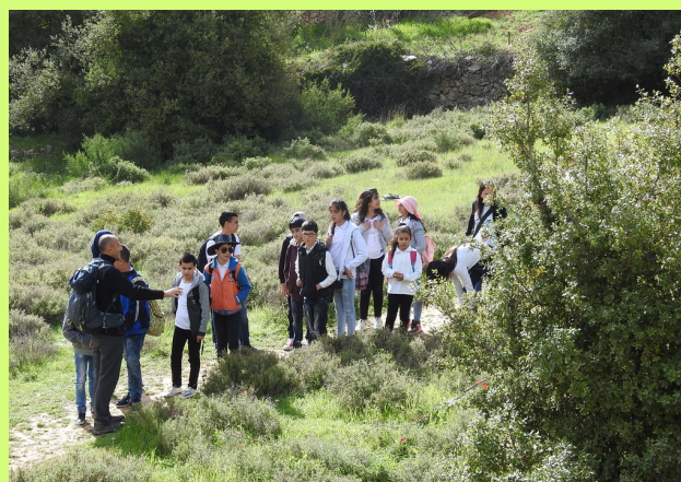
Pausing to study the plants