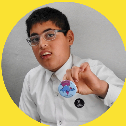
A proud student showing his badge of achievement