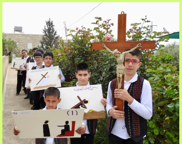
Stations of the Cross procession