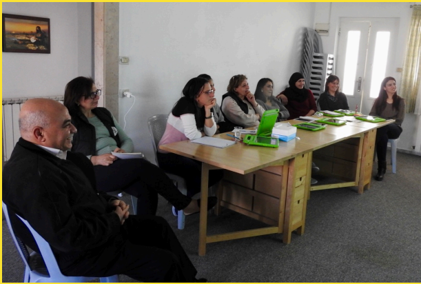
iPads up and ready for action during the Ministry of Education IT department training