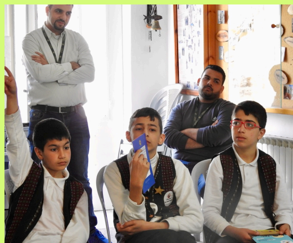
Students questioning, contemplating and listening to the National Bank of Palestine's presentation, while two bank managers (in back) observe our students with great interest!