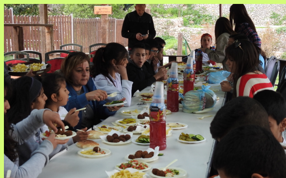
After a long hike, a delicious lunch was had by all