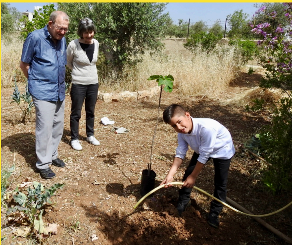
A dedicated student helps plant a special fig tree