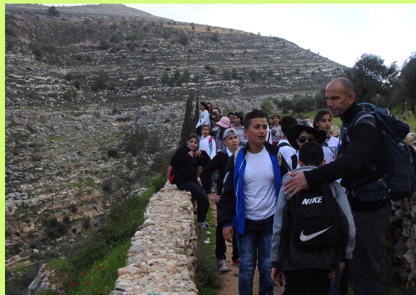
Hiking into Battir with our nature guide