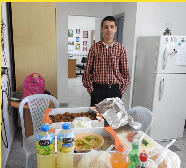
A most delicious luncheon provided by one of our graduates!