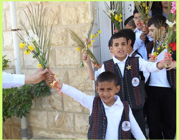
Hosanna in the Highest and our Palm Sunday procession begins!