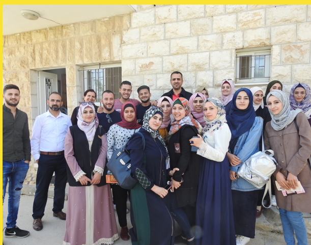
Students and Faculty visiting from Nablus Open University

one they gave in the fall. Additionally, those who were interested could receive an individual session, which focused on the reduction of physiological stress. Given the environmental stress of this region, this was a tremendous gift for our staff.