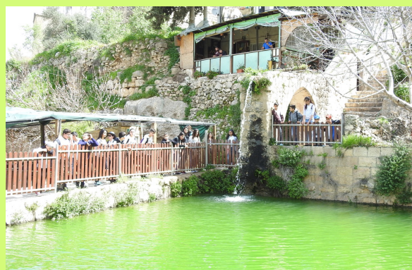
Viewing the Roman Pools in Battir