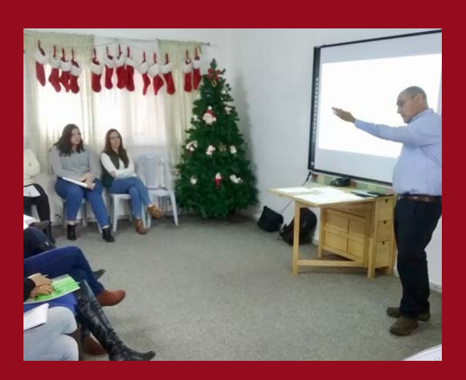
Bridges To Evangelization Training