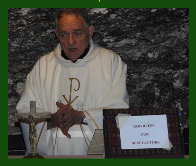
Prayers For The Intentions of our Benefactors