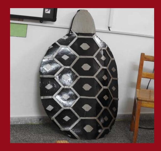
The finished masterpiece!