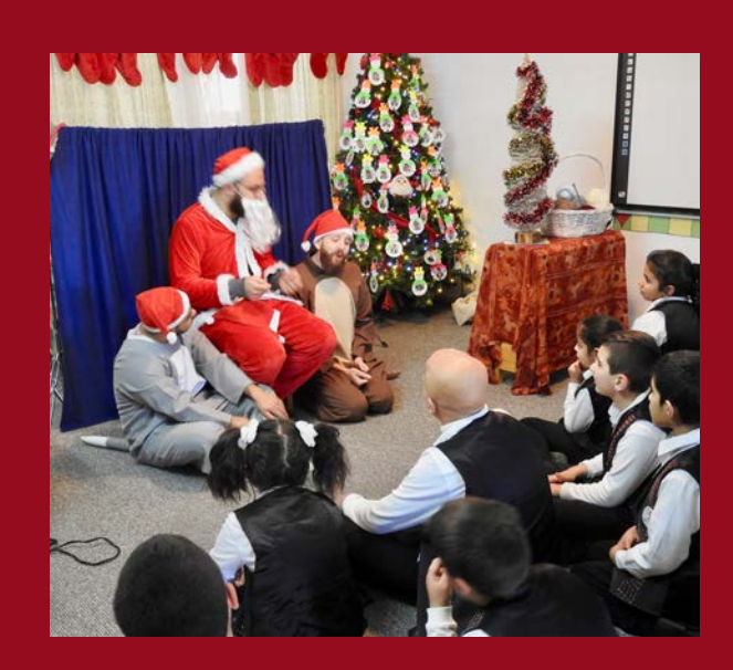
A Visit From Santa And A Christmas Play!