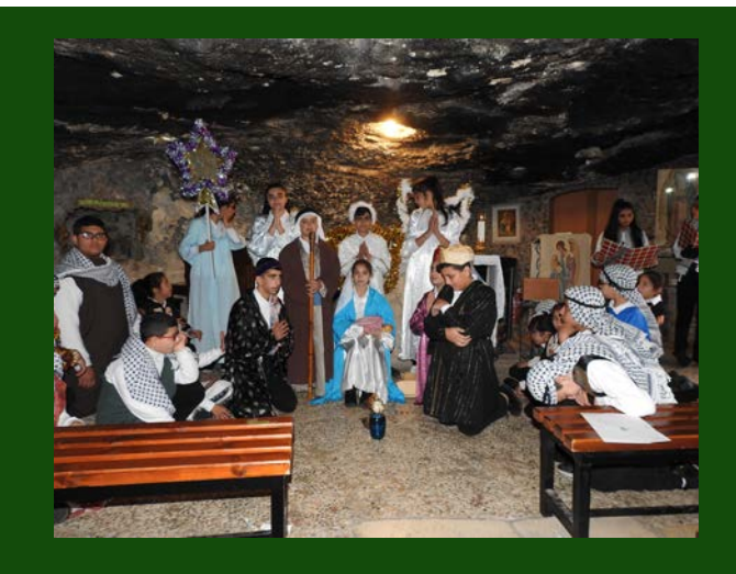
Christmas Mass & Nativity Play In The Grotto At Shepherd's Field