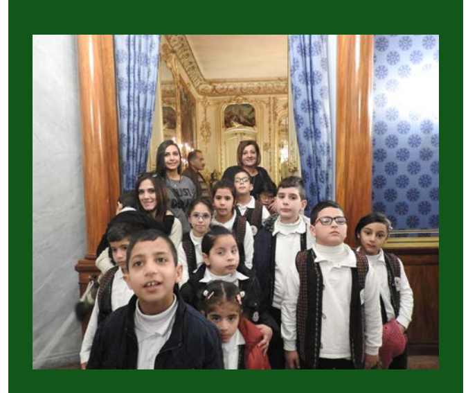
Visiting the European Period Rooms