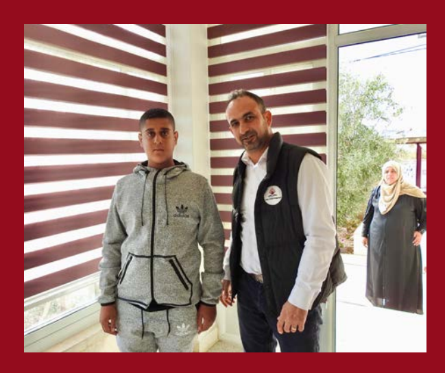
One Of Our Great Graduates & His Mother Make Time To Visit With Us

program and mothers group we are able extend our outreach to the community.