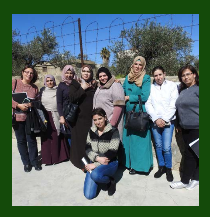
Our Incredible Mothers In The Group of Peace