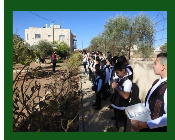
All Souls Day Prayers In The Rose Garden