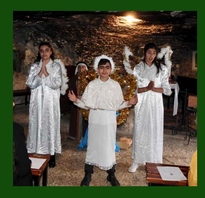
Thank You To Everyone For Helping Us Spread "The Good News"!